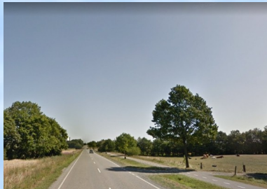
The site of the incident

A 24-year-old man was driving to visit his parents in Vejle in Jutland, Denmark, when he experienced a dramatic stop of his car. It happened when a disc-shaped UFO with a powerful light hovered over his vehicle. The object was only 3-4 meters above the car, and he could see a number of circular lamps on the underside. After a short time the intensity of the light from the UFO diminished, and it slowly moved away and out of sight. Then he was able to start the car again normally.