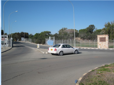
The barracks of the incident

Unspecified day of September, round 3 am Source: Les Hewitt from Jenny Randles and in The Encyclopedia of Alien Encounters