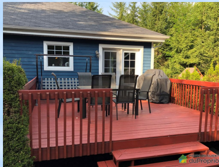
Site of the event, today