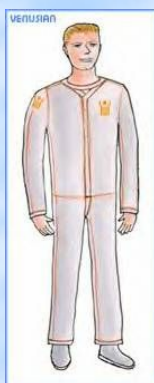
Sketch of the humanoid

Mr Fenner was exploring a remote area of the Amazon jungle called Rio Mamoré when, after getting up early in the morning, he observed a silent disc shaped object passing overhead to then descend behind some trees, out of sight. The witness