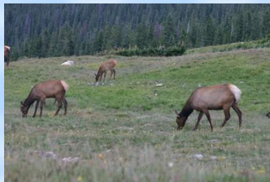
The site of the incident