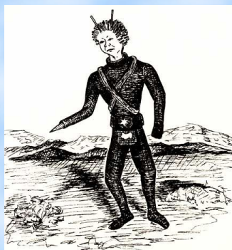
Two sketches of the being he encountered