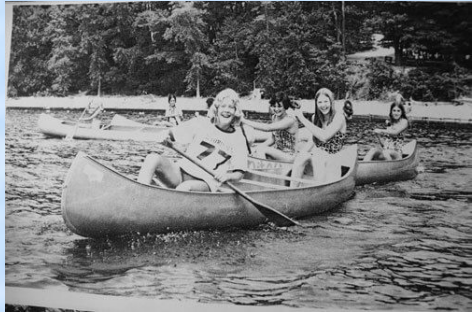
Rare photographs of the site of the incident in the 60s camp