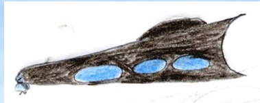
Sketch of the creatures, their hand and their craft drawn by the witness