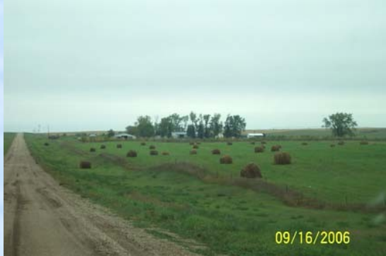
Briese cattle farm in Tappen, North Dakota, on September 16, 2006.