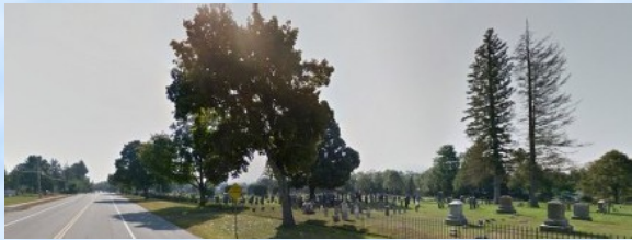
The Westlawn Cemetery; the craft got closer and lower to the road.

This, basically, is the "meat" of the Goffstown incident. After officer Jubinville arrived, the four went outside and spotted an object whose light seemingly went out when a flashlight was trained on it, and appeared to move slightly, occasionally changing colors. However, in his evaluation of the report, Mr. Webb said: "The multiwitness phase of the sighting, in my judgment, must be ruled ambiguous and therefore nonsupportive of the Morel sighting because (1) the object, as described by all four observers, matched the appearance and behavior of both the planet Mars and the UFO (the latter when seen at a distance) and (2) the planet's known position was too close to the UFO's estimated position to entirely dismiss the planet from contention."