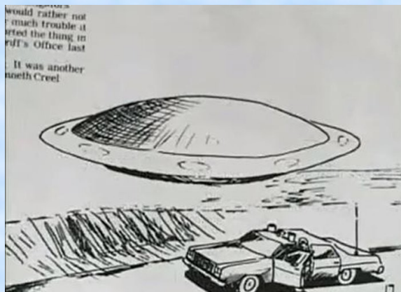
Sketch of the scene of the incident

much more believable and, in turn, more frightening. And according to one of the witnesses, "people are still seeing UFOs around Flora." He continued, "...the sightings are a town secret."