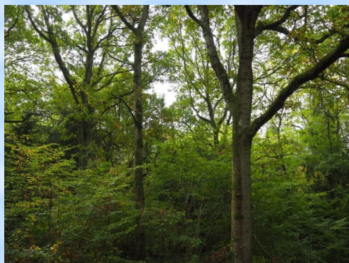
The woods where Mr Frescogna stumbled in two patches of earth where plants no longer grow