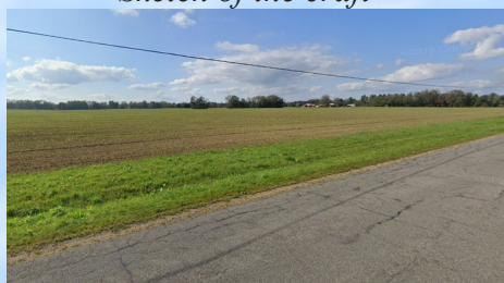
Alleged site of the incident, today