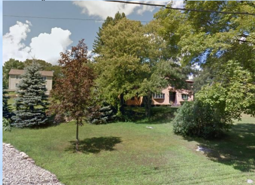
The Goulds' residence on River Street

misunderstanding of natural phenomenon, maybe vehicle with working team on board, one single witness, children didn't see much