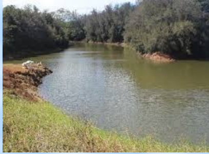
The site of the incident today