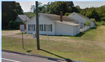
The site of the incident

Reliability evaluation: very high one witness only, no corroboration, possible confusion