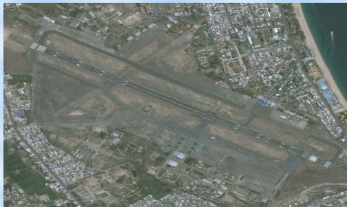
Air view of the Nha Trang American abandoned base on Than Phù road, the site of the incident

The Nha Trang incident, if thorough documentation can be obtained, could become a UFO “classic” according to one NICAP investigator familiar with the case. The sighting allegedly occurred during one of the most active periods of the Vietnam conflict, and understandably received little publicity at the time. Now, however, with American participation in the war