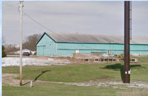
The area of the incident in Mt Vernon, Missouri