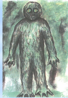
Sketches of the incident