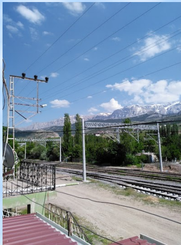
The site of the incident, today

A 15-year old shepherd boy named Behoet Ocal was eating his lunch when a bright light landed nearby on a mound of rubble.