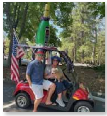
Second Place—The Kemmers