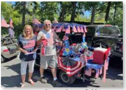
First Place—The Hatfields