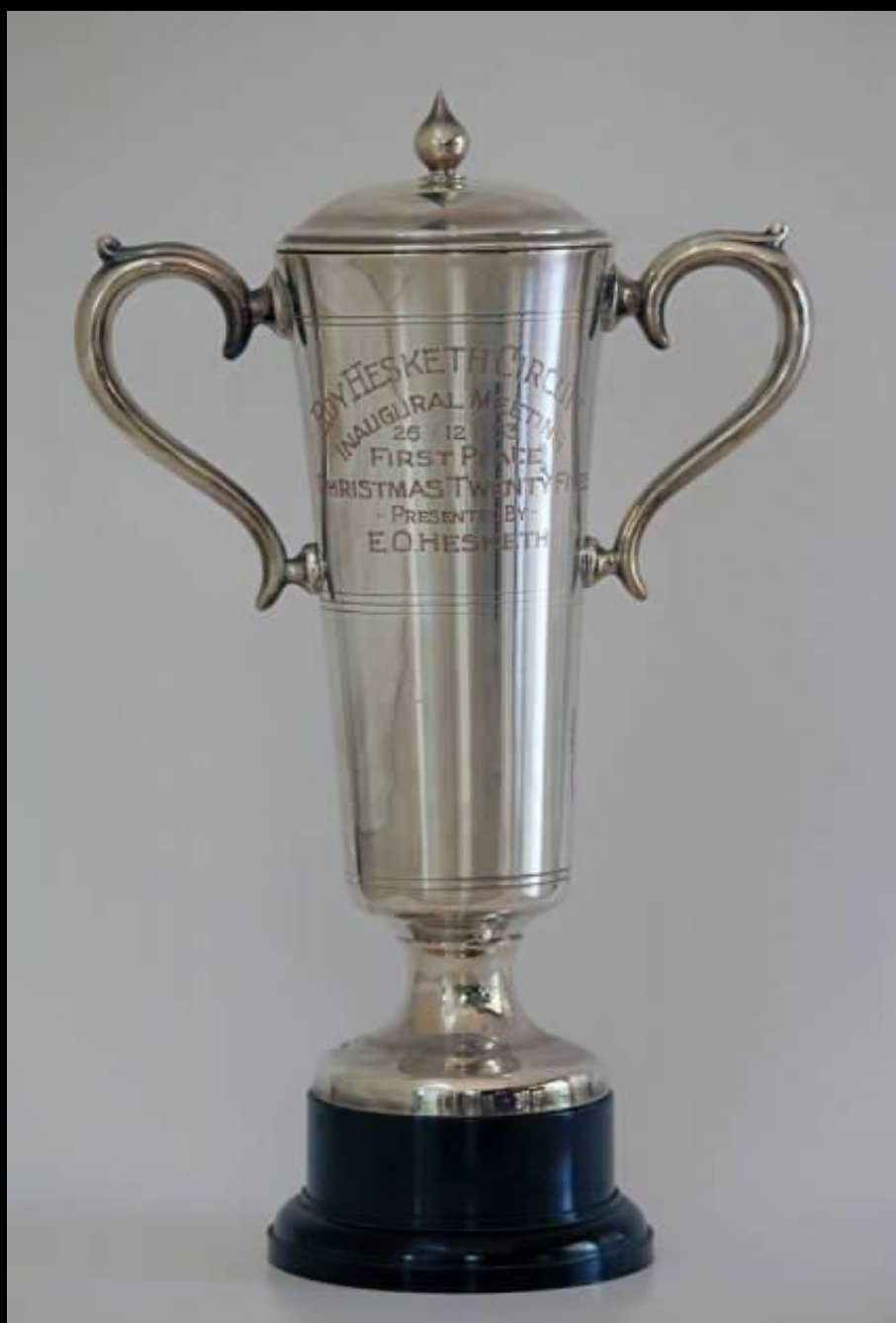
The race programme and trophy image kindly donated by Rory Milbank