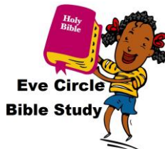
Eve Circle Bible Study

On Sunday June 10 th , 2018 immediately following the service, we will hold a congregational meeting. Purpose of the meeting is to explore a council recommendation to dissolve the current mortgage fund and replace the mortgage fund with a capital improvements fund. The scope and nature of the new fund will be part of the discussion at the meeting.