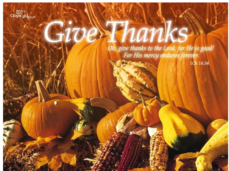
Thanksgiving November 28, 2024

"Office Hours: Tues and Thurs 9am-2pm, and by appointment. It is strongly suggested to call ahead before dropping by. Pastor is off Mondays.