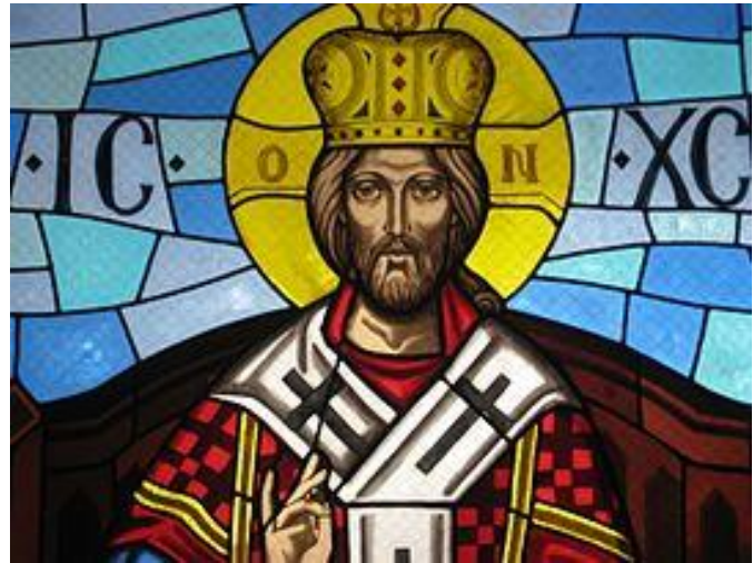
Christ the King Sunday November 30, 2024

Church Web Site: www.joylutheranelca.com