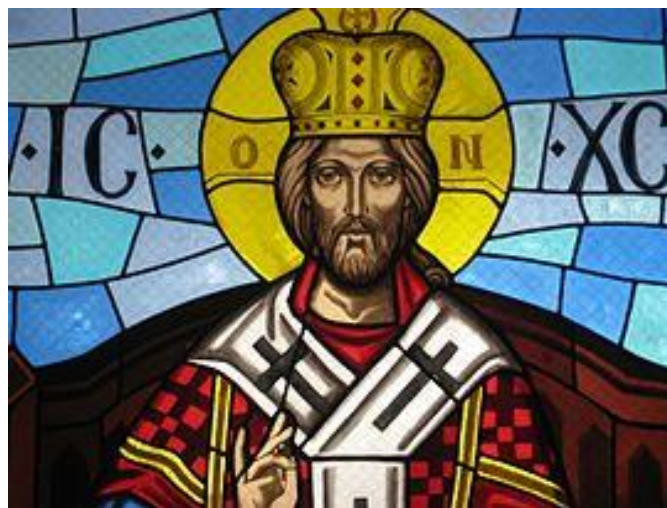
Christ the King Sunday November 21, 2021

Church Web Site: www.joylutheranelca.com