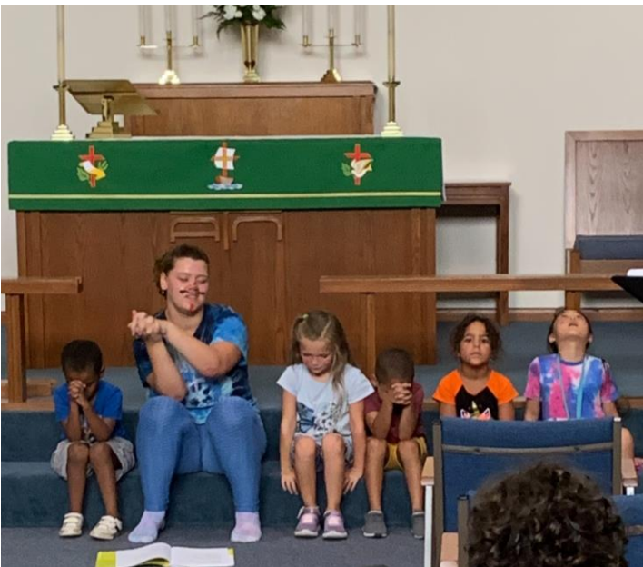
END OF DAY PRAYER