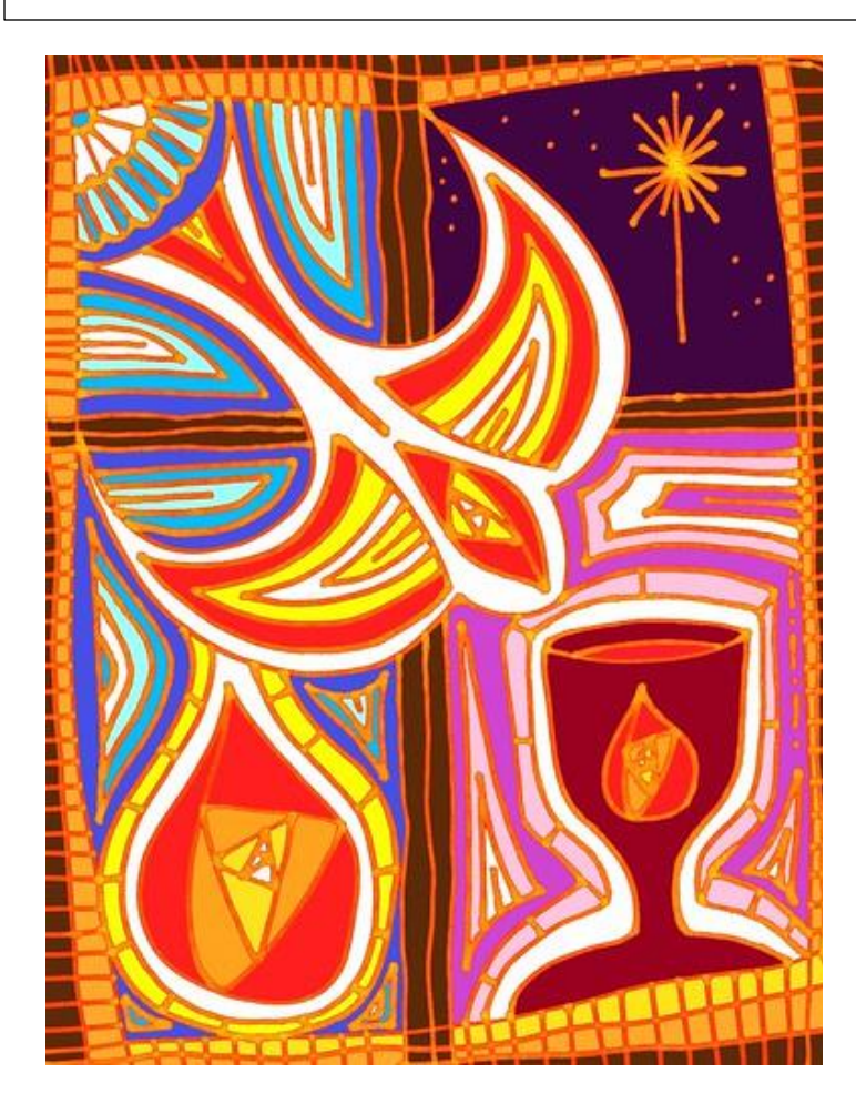
With God's help we will get through this pandemic and worship together soon again.

"Office Hours: Weds and Thurs 9am-2pm and by appointment. It is strongly suggested to call ahead before dropping by. Pastor is off Mondays except for last week of month, when Friday is day off. Best means to contact pastor is 321-312-7339 or pjdbryant4tide@gmail.com."