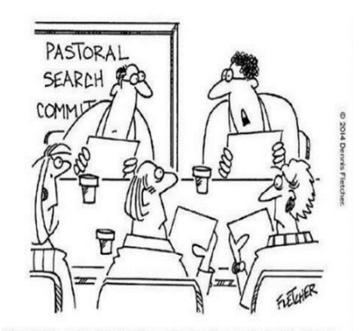
"Basically, we're looking for an innovative pastor with a fresh vision who will inspire our church to remain exactly the same."

2) In 1990, a home interior designer was dying. He loved