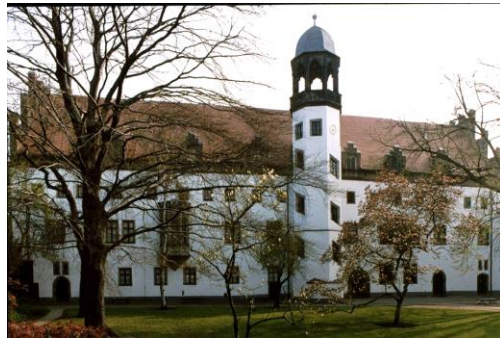
Luther's home: The Black Cloister