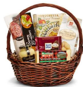
SILENT AUCTION BASKET