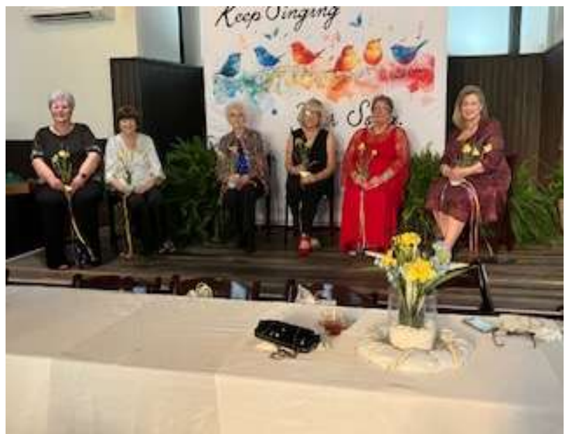
Alabama 2025-26 Board