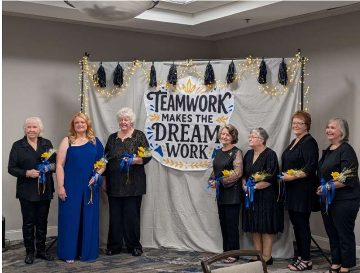
Louisiana 2025-26 Board