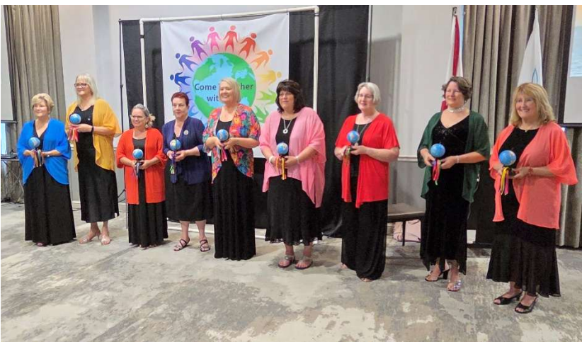
Left – 2025-2026 Florida State Council