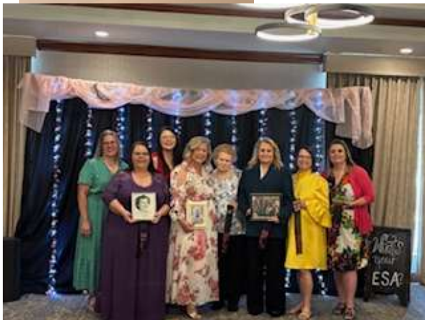
Above-Arkansas Below-North Carolina