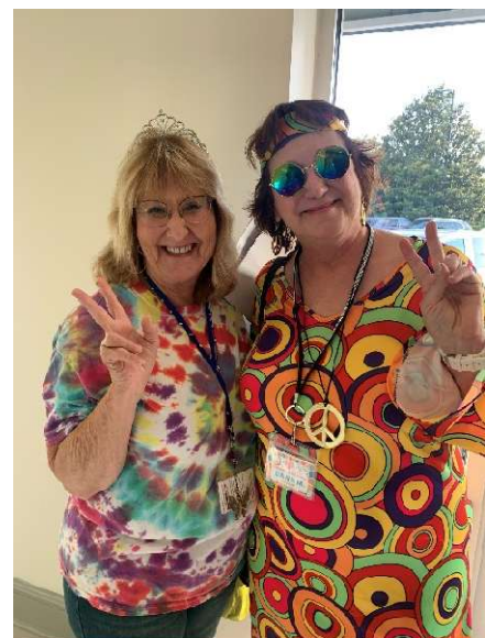
Georgia 2025-26 Board