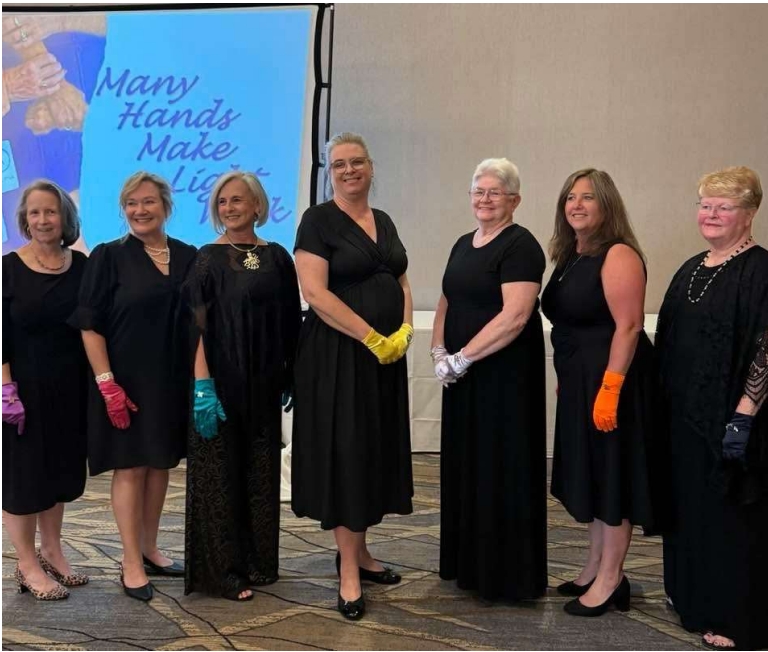
Left-VA State Council 2025-26

I had the privilege to travel to BOTH Kentucky & Tennessee for their State Conventions as their SERC representative. I ate the most amazing meals and was so welcomed by both State Councils. I was truly impressed by the service hours and philanthropic monies that these states achieved and I am looking forward to what the States will accomplish in the next year and seeing everyone again at the IC Convention and the SERC Conference. I hope everyone is planning to attend both!