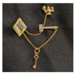
Position of Gavel Guard after presidency