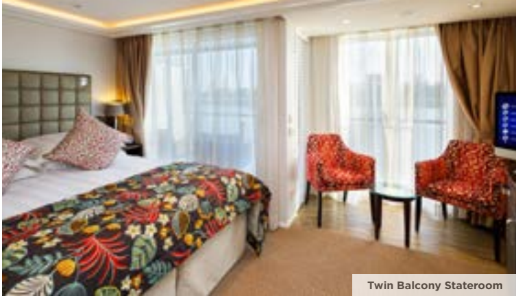
Twin Balcony Stateroom

October 19-29, 2026 | aboard AmaKristina