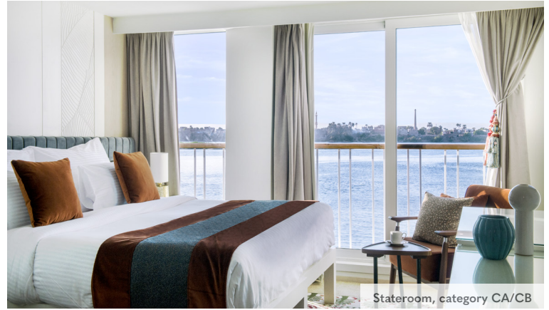
Stateroom, category CA/CB