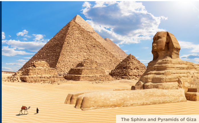
The Sphinx and Pyramids of Giza

November 11-22, 2026 11-Night Land & Nile River Cruise Journey