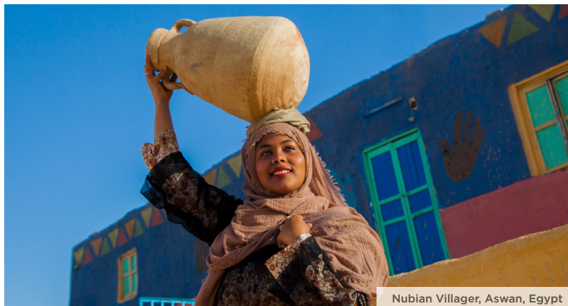
Nubian Villager, Aswan, Egypt

* Guests can reserve the optional Abu Simbel tour ($395 per person) at time of reserving Nile adventure.