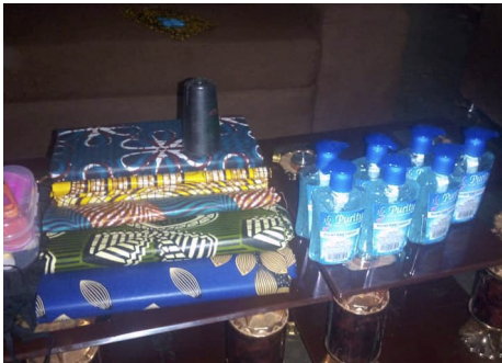
Purchased fabric and sanitizer