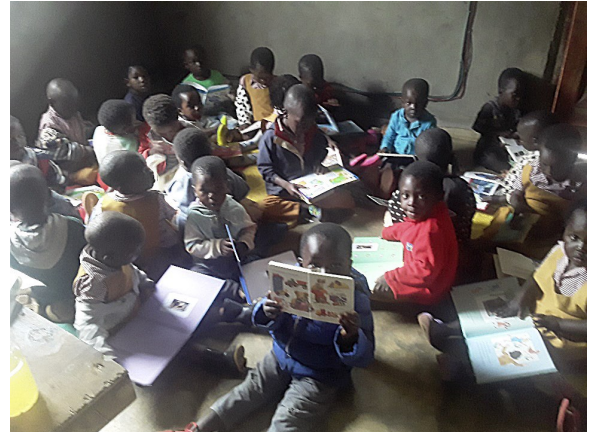
Readers at Chimwang'ombe center

Due to COVID19, in Malawi all of the schools are closed, and the normal MoH center activities have been suspended. But all 6 of our libraries are still open and operating under the direction of Milca. The libraries have become central to the lives of many children. Now acquainted with books, and suddenly with time away from school, many are flocking to the libraries! The older teens are reading to the younger children to avoid the transfer of any virus, and to keep the books as clean as possible. All children have been taught proper handwashing with soap and water, which is required before entering the libraries.