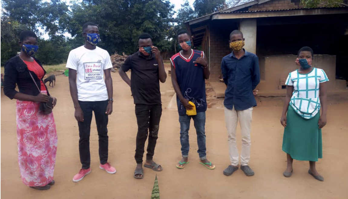
Making masks at Khwamba