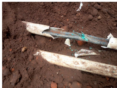
The break uncovered!