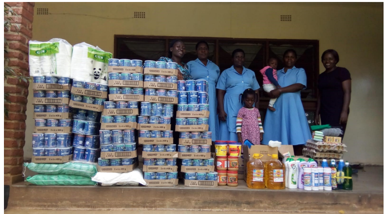
Purchased formula, foodstuffs, and cleaning supplies

Subsequently we've learned that Valley Presbyterian Church, Scottsdale, AZ also provided funds that will carry the baby formula and other supplies for an additional 4 months! How terrific to see how God led the rescue of these tiny ones!