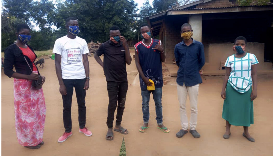
A successful day making masks!