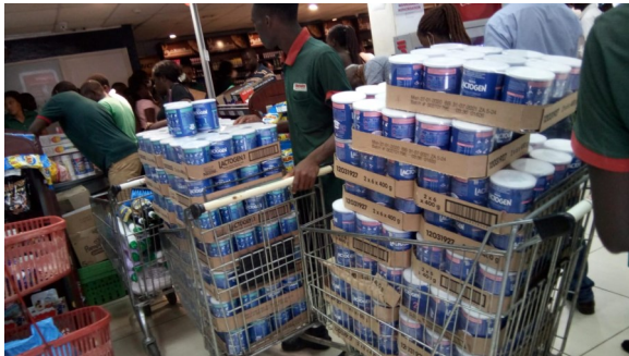
Shopping in Lilongwe