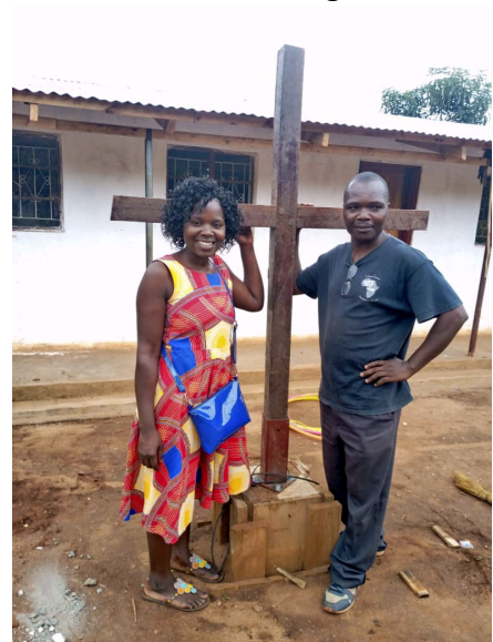
Our troubleshooting team!