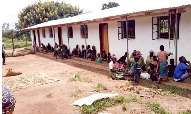
Completed Learning Center at Khwamba