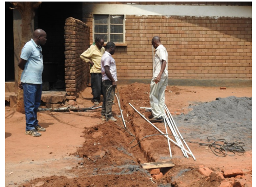
Wiring in 2017

It is great when maintenance and emergencies can be handled by our partners!