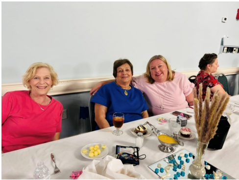
A little shenanigans going on with the SERC Executive Board at the Friday Night Mixer