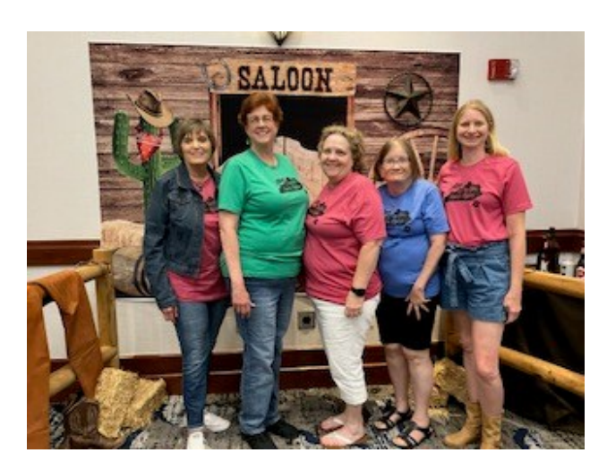
Kentucky delegation at the Welcome Party