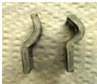
Squeezed assembly(l) Original (r)

2) Squeeze in the vice until the bottom edge of the flat portion makes contact with the vice jaws.