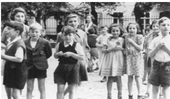
CHILDREN IN THERESIENTADT GHETTO

Truth- already being aware the Jewish leaders would let everyone else die & only care about themselves; not to mention, would exploit this falsely via media – they were truly given their very own higher-grade camps with luxuries & freedoms the travel; which none of the Christians had. Their new stories weren't even taught until 1948!