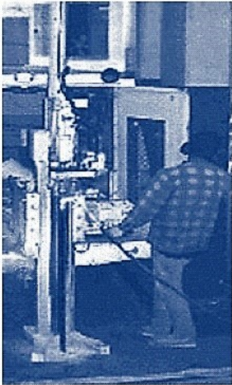
Installation of treatments liquids using the high-pressure Remediation Injection Process (RIP®)