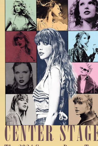
The 2024 Summer Dance Tour

Calling all SWIFTIES ages 6-13! Join us for JAZZ and HIP-HOP fun inspired by songs and activities related to all things Taylor Swift! (With a TON of friendship bracelets traded!!)