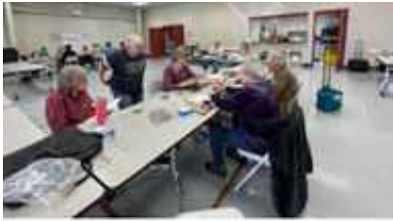
November's Workshop By Sue W. Bicycle Earrings