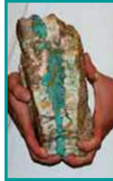
Rare Turquoise specimen from the Bisbee Mine Which is located in Bisbee, Arizona

The name originates from the French phrase “pierre turquoise” meaning “Turkish stone” because turquoise was brought to Europe by Venetian merchants who first acquired it in Turkish bazaars.