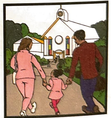
Going to Church