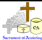
Sacrament of Anointing