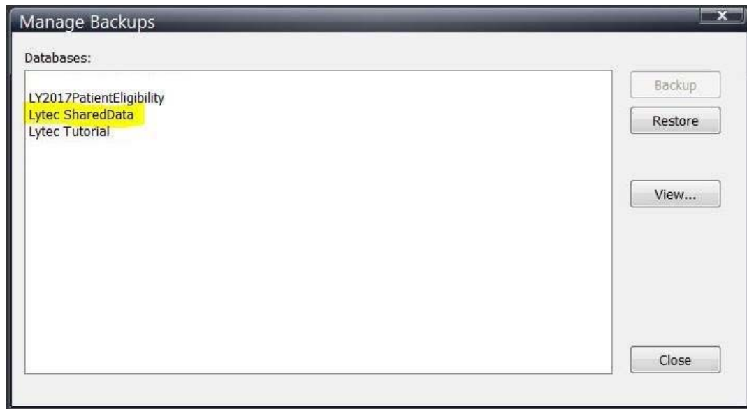
Figure 3. Manage Backups screen