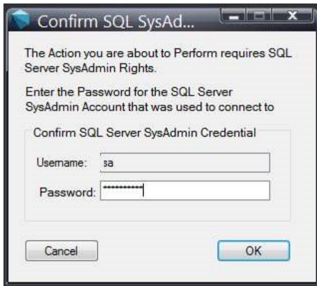
Figure 2. Confirm SQL SysAdmin screen