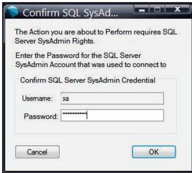
Figure 2. Confirm SQL SysAdmin screen