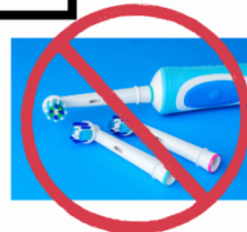
Electric/Battery toothbrushes and heads.