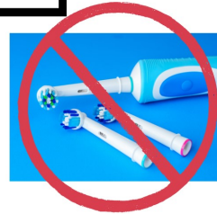
Electric/Battery toothbrushes and heads.