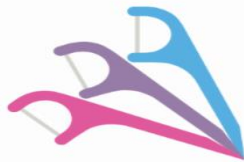
(Used floss picks)