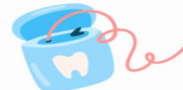
(Empty floss container