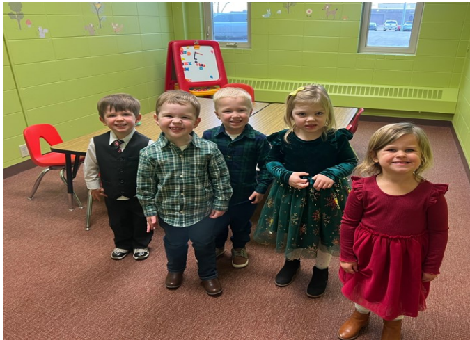
Sunday School Christmas Program December 8, 2024