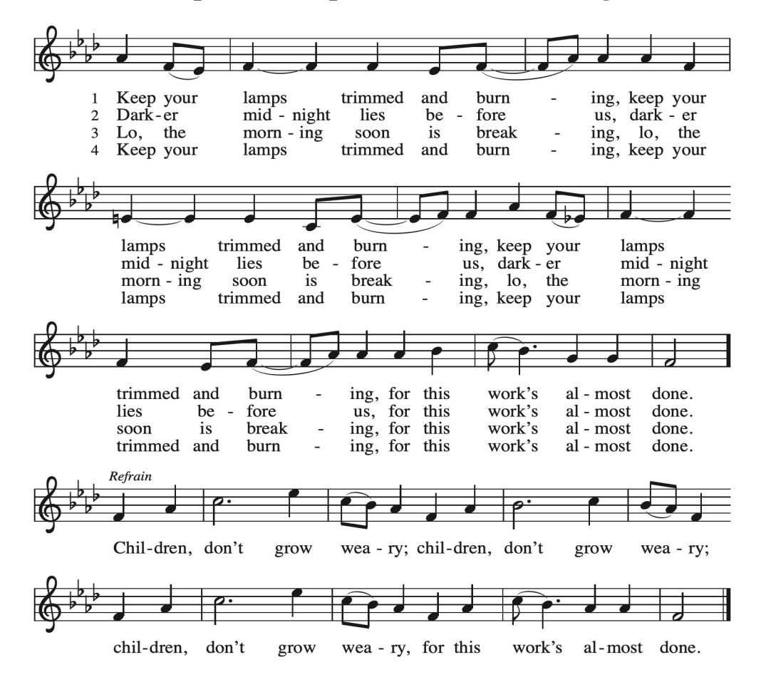
Text: African American spiritual