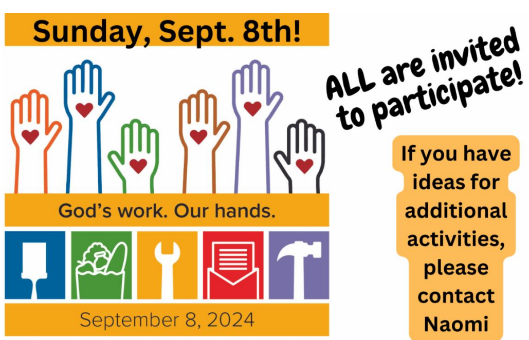
A light lunch will be provided beginning at 11:00am

When you have been hospitalized and then move into a health care facility, please contact the church office to let us know which facility you will be moving in to. The hospitals are not allowed to forward that information to our Pastoral Staff, and they would love to keep in contact with you as you after your hospitalization.