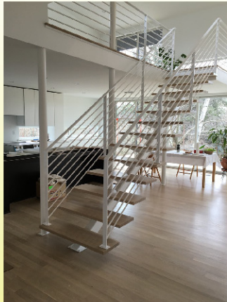
Custom made iron stairs and railings

Gazebos Pergolas Arbors Gates Wine Racks Beds Furnishings Kiosks Coffee Stations Room Dividers Signs