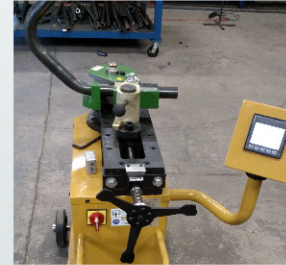
Digital pipe bending

Railings Gates Ladders Window Guards Horse Stalls A/C Cages Stairs Restroom Stalls Decorative Iron Brackets Retail Displays Reception Desks