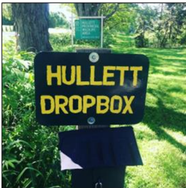
Hullett Dropbox located at the Office Complex at 41378 Hydro Line Road

Funds from your $35 annual membership donation is used for property maintenance, infrastructure upgrades, habitat restoration, invasive species control, public education, trail work, signage – everything and anything we need to keep Hullett thriving!